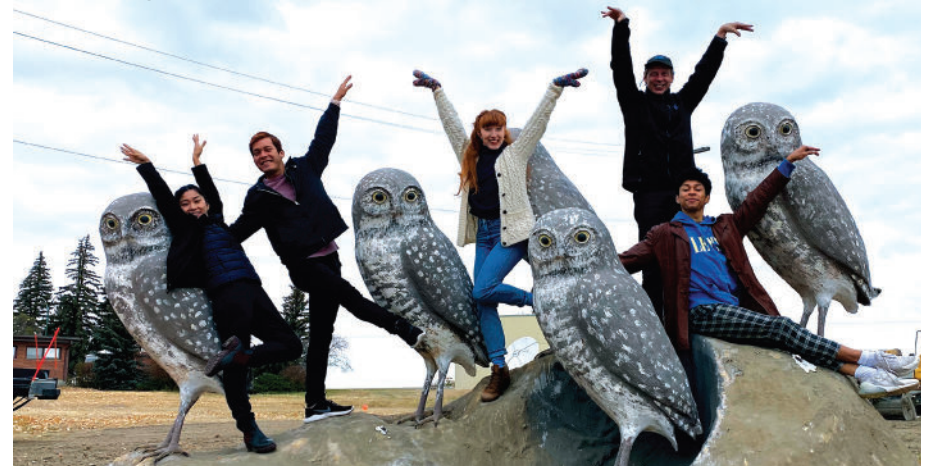
Sculpture of burrowing owls in the town of Leader, Saskatchewan.

DONATE TO LOCAL SASKATCHEWAN PROGRAMMING Visit jorgendance.ca to learn more.