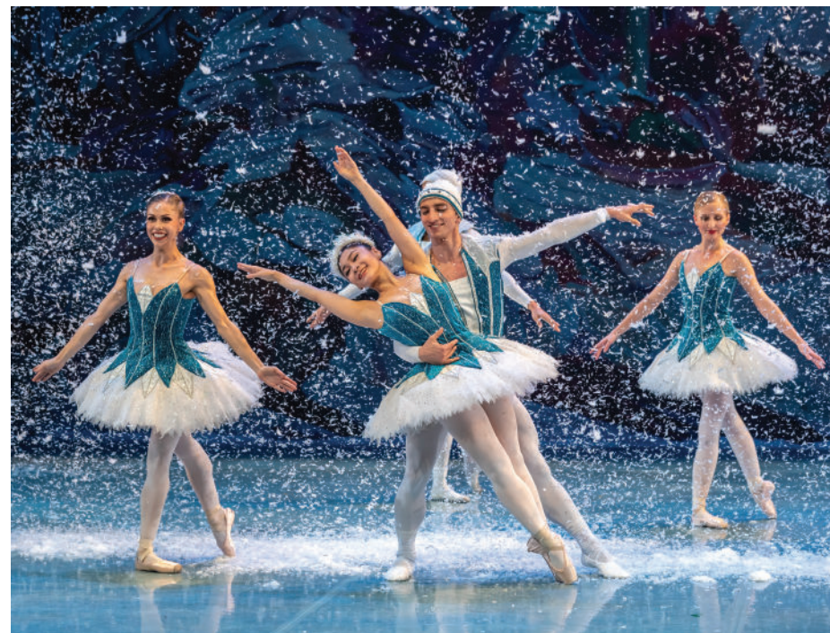
Snowflakes; photo by Cait Media Group Corp.