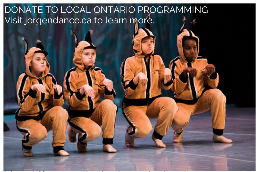
"Chipmunks" from our Local Participant Program