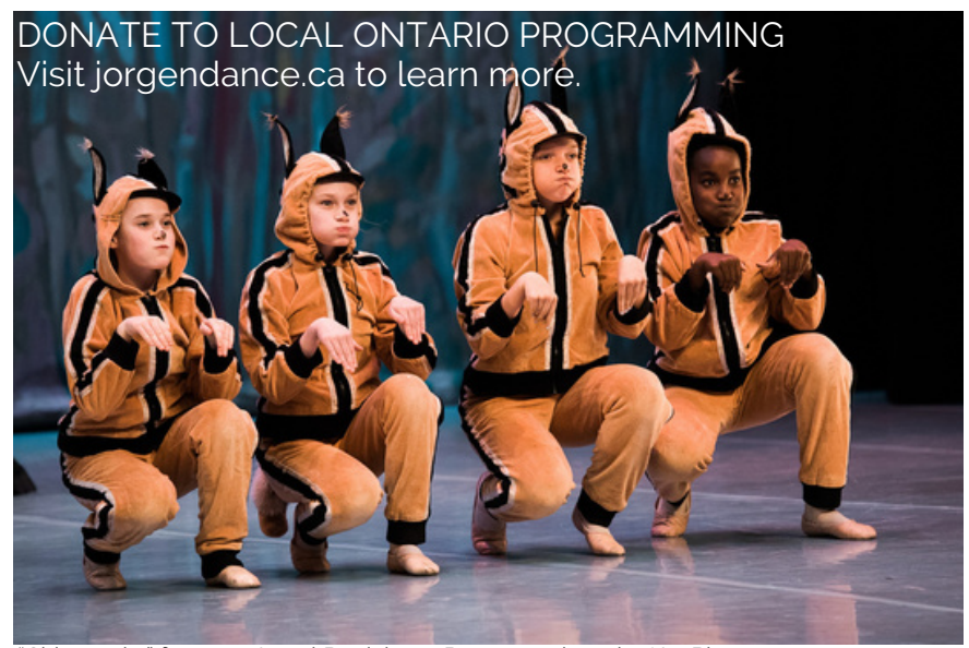
"Chipmunks" from our Local Participant Program