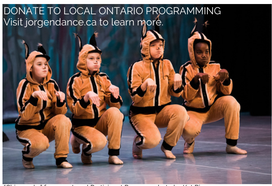
"Chipmunks" from our Local Participant Program